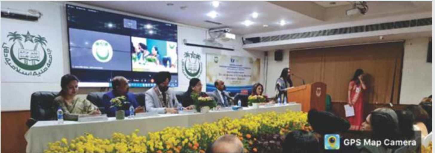
GPS Map Camera