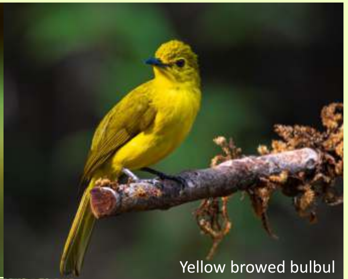
Yellow browed bulbul