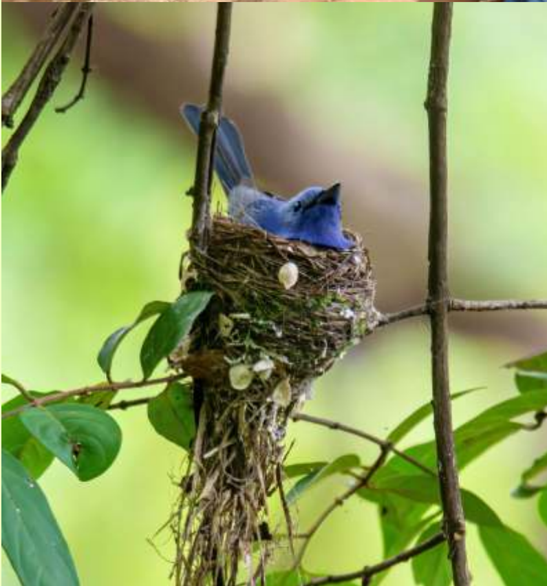
Black nape Monarch

The Jungle Enriched by Kali River---Dandeli Dandeli forest never disappoints you with abundance of fauna, flora and birds. Located in Karnataka, this jungle is native to many birds species as well as migratory. Jan to March is the best seasons to visit