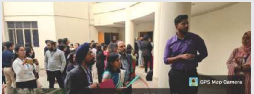
GPS Map Camera