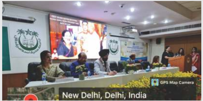
New Delhi, Delhi, India