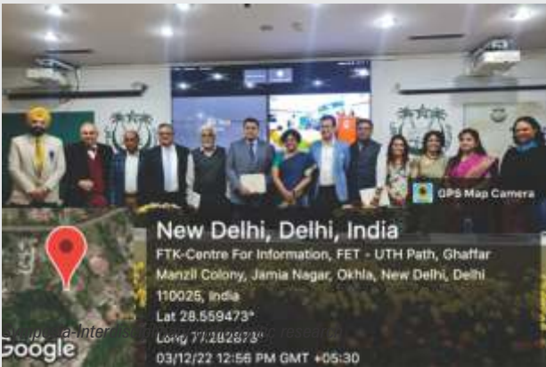
New Delhi, Delhi, India

FTK-Centre For Information, FET - UTH Path, Ghaffar Manzil Colony, Jamia Nagar, Okhla, New Delhi, Delhi 110025, India Lat 28.559473° Long 77.282873° 03/12/22 12:56 PM GMT +05:30