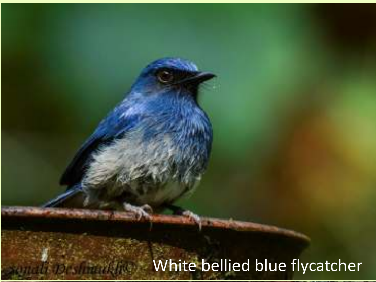
White bellied blue flycatcher