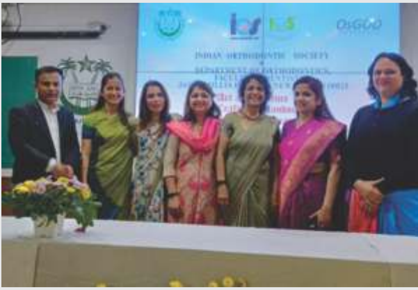
Workshop on Literature search and Bibliography Management