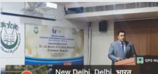
New Delhi, Delhi, भारत